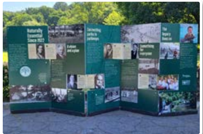
Display created to mark the 100 year anniversary of the Parks Commission which was shown at different parks throughout the county.

The July launch of the 100-Anniversary traveling station coincided with Parks and Recreation month, which acknowledges that parks are vital to many residents. PRC has brought joy and activities to our community for a century. We celebrated not only the anniversary but continued to acclaim our parks and recreation professionals who work hard for Westchester residents.