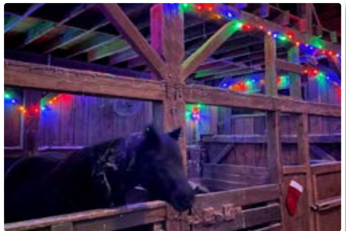
A horse at the farm enjoys the upgrade to the barn in one of the numerous features of the new event.

On Saturdays, the fun included a holiday market at which people could buy gifts and other treats. On scheduled dates, popular food trucks, such as Wanna Empanada and Fork in the Road, sold their delicacies to enthusiastic visitors.