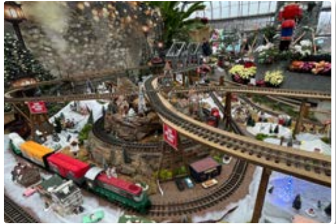
Inside the conservatory the festive train display includes multiple trains running on elevated bridges, loops and tunnels.

Visitors got to watch elves at work, say hi to some playful snowmen and much more. Children were thrilled when they met the jolly fat man himself, Santa Claus! This year's show was a smashing success and continues to be a favorite holiday event!