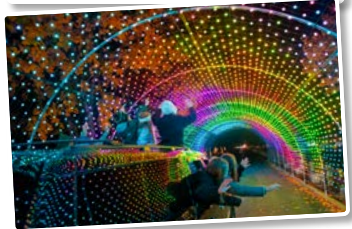
TOP: Toy soldiers hold up the Winter Wonderland arch with huge hand-made ornaments to welcome the public. BOTTOM: A car full of friends and family seem to float as they drive-thru the multi color light tunnel.