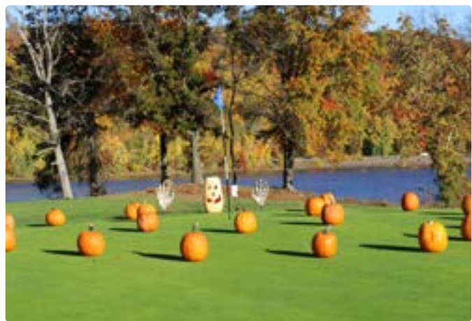
Pumpkins decorate the green at Sprain Lake Golf Course and become a fun challenge during the annual Halloween Scramble Tournament.