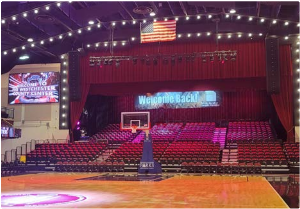
TopRight: Westchester County Center transformation. Wooden floor removed, treatment rooms and offices constructed as a COVID medical facility. CenterBottom: Westchester County Center final conversion back into all its glory as an entertainment arena.