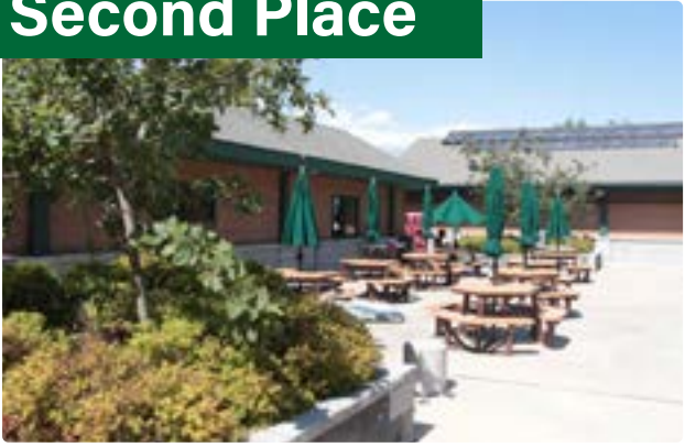
Saxon Woods Park ▪ White Plains