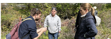
Volunteer Enrichment Series

These events are designed for individuals who have volunteered with WPF in the past and are looking to gain a deeper understanding about our parks.