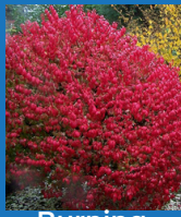
• Burning Bush